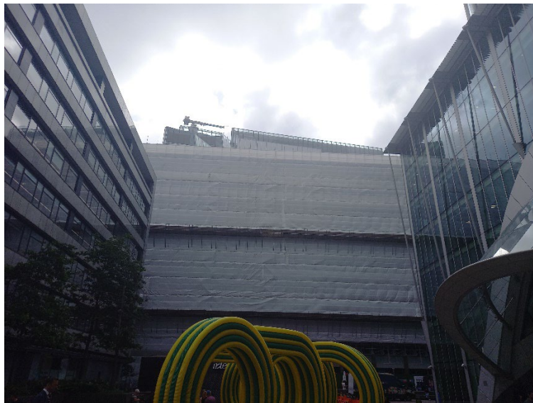
New union street – Scaffolding complete