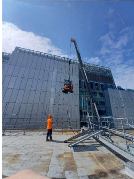
Typical floor demolition - level 9