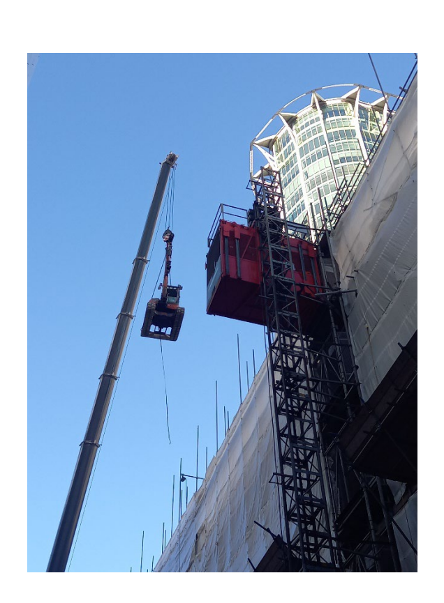
Excavator lift level 4